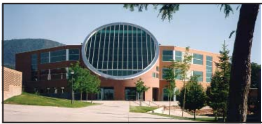
Gerald R. Sherratt Library, SUU